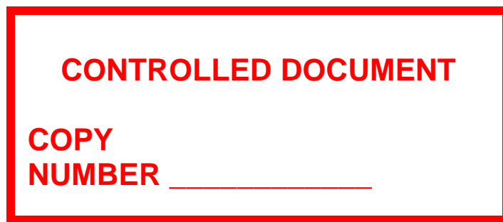
Figure 3. Example of Controlled Document Stamp.